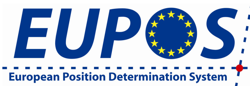
Figure A1.1: Registered EUPOS word and image trademark