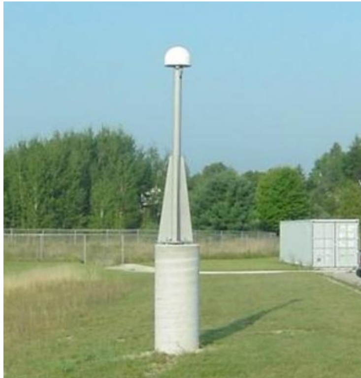
Figure 12. Earlconic monument of the station BGR Big Rapids, Michigan, USA

The ‘Earlconic’ antenna monument applied at the Michigan Spatial Reference Network is an excellent example because of its stability and low multipath potential (see Figure 12.). The cylindrical poured concrete pillar has a diameter of 60 cm, it is descending 3.6 m in the ground and also extending 1.5 m above the ground surface. Internally, a re-inforced steel rebar cage extends from top to bottom supporting the concrete. The pillar is surmounted with a spun aluminium finned pole either 2.4 m in height or 4.8 m in height depending on the local obstructions.