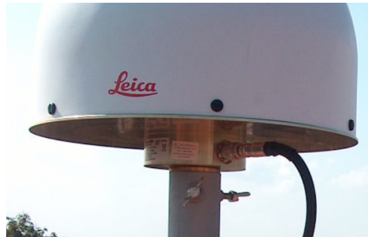
Figure 21. Antenna adaptor used in the GNSSnet.hu network of Hungary

4.3 The antenna reference point ideally will be mounted directly vertically above the marker (i.e., horizontal eccentricities ideally are zero).