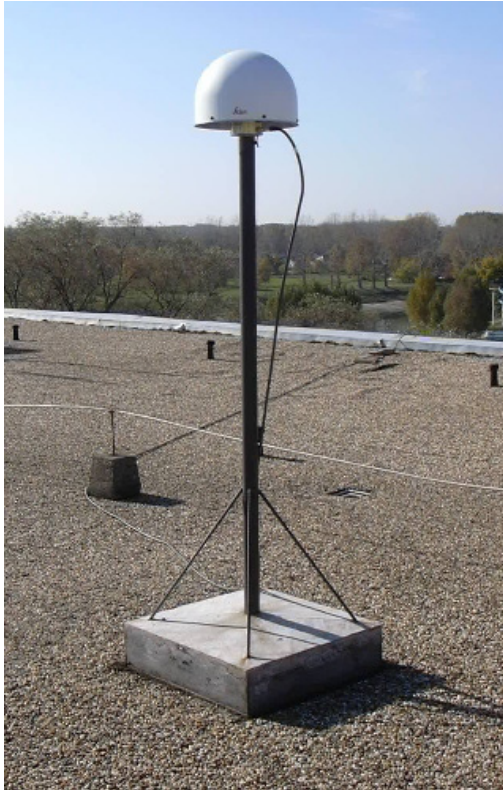
Figure 18. Antenna installation on flat roof at station BALE Baja, Hungary

The antenna mounting pipe can also be fixed to the side of a penthouse building. The pipe must be rigidly attached to the wall. Figure 19 shows a monumentation example where the applied pipe length can result in harmful antenna vibrations in strong winds. Therefore it is recommended to reinforce the pipe like on the Figure 20.