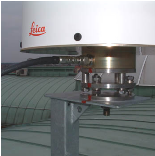
Figure 20. Antenna adaptor used in the CZEPOS network of the Czech Republic

4.2 The reference station antenna shall be rigidly attached, such that there is not more than 0.1mm motion with respect to the antenna mounting point.