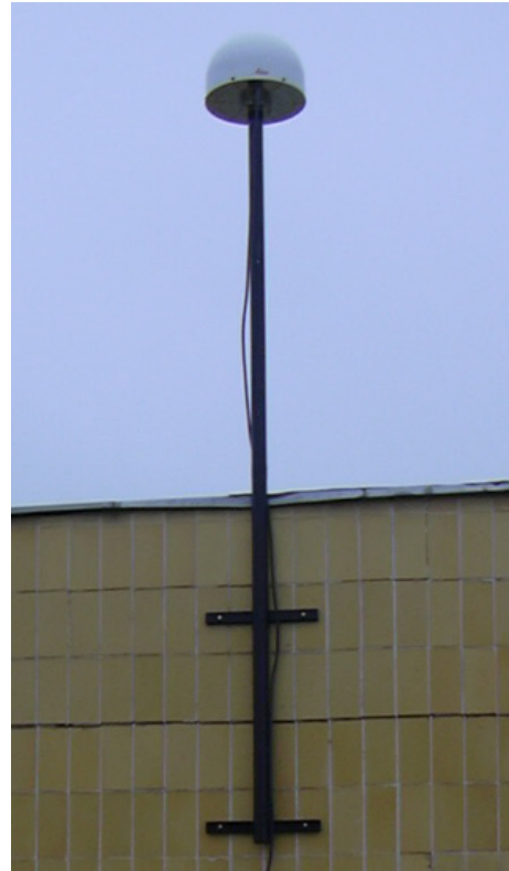
Figure 19. Wall-mounted antenna holding iron pipe at station MISC Miskolc, Hungary