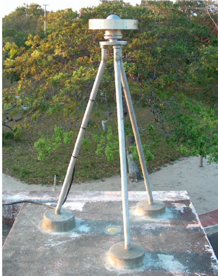
Figure 13. Steel tripod monument on a rooftop at station BRFT Eusebio, Fortaleza, Brazil

A good example for stable roof-top monuments with the antenna mounted at a sufficient distance from reflecting surfaces is displayed on Figure 13. The antenna mount is welded atop a 2-m tall steel tripod on the roof of the building. (Please note that Figure 13 is a good example for antenna monumentation only. A site with nearby trees that can cause signal obstructions should not be selected by EUPOS network operators.)