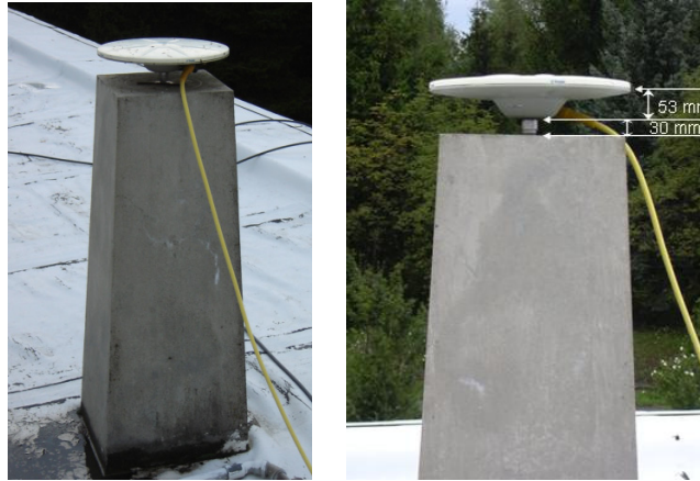
Figure 5. Bulky reference station pillar of station PENC

The near-field multipath effect can be significantly mitigated by the calibration of the reconstructed near-field multipath environment along with the antenna PCV. E.g.: The NETPOS RTK network of the Netherlands is equipped with small rover antennas without any means of multipath reduction (see Figure 6.). The use of such an antenna model and a special antenna adaptor is responsible for significant height errors in positioning caused by near-field multipath effects. This effect could largely be reduced by the robot calibration of the antenna together with the reconstructed near-field multipath environment.