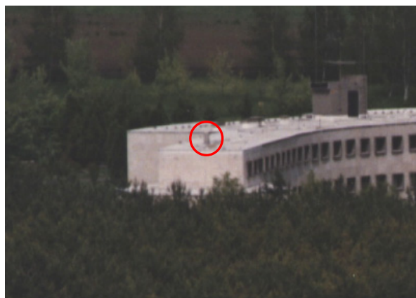
Figure 2. Penc, observatory building with reference station pillar in 1997