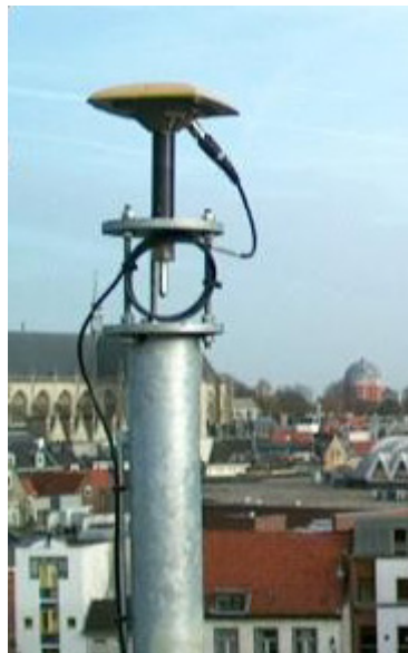
Figure 6. Antenna setup used in the NETPOS RTK network of the Netherlands causing strong near-field multipath

The near-field multipath effect can be significantly mitigated by the calibration of the reconstructed near-field multipath environment along with the antenna PCV. E.g.: The NETPOS RTK network of the Netherlands is equipped with small rover antennas without any means of multipath reduction (see Figure 6.). The use of such an antenna model and a special antenna adaptor is responsible for significant height errors in positioning caused by near-field multipath effects. This effect could largely be reduced by the robot calibration of the antenna together with the reconstructed near-field multipath environment.