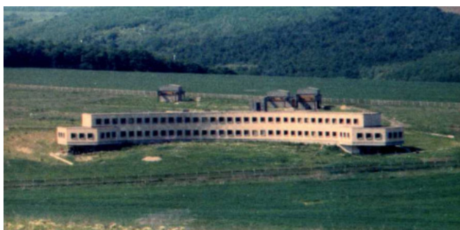
Figure 1. Penc, observatory building in 1982