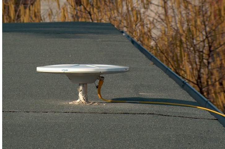
Figure 4. Near-field ground bounced multipath environment

the antenna mount (e.g. iron pipe) above the surface elements and the applied monumentation should be carefully selected. If highly reflective surfaces cannot be avoided around the antenna it is recommended to cover such surfaces with microwave absorbing material (e.g. paint). This should be done every few years because of the aging.