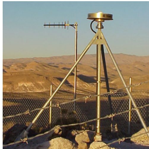
Figure 11. Deep Drilled Braced Monument

Reinforced concrete pillars are stable monuments. The pillars are normally coupled to bedrock or founded on a larger mass of concrete set within a pit in soil.