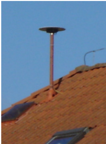
Figure 16. Antenna mounted on top of a pitched roof at station NYIR Nyírbátor, Hungary

An antenna holding pole or pipe can also be built on top of a pitched roof. The lower part of the pipe must be rigidly fixed to a weight-carrying wall of the attic.