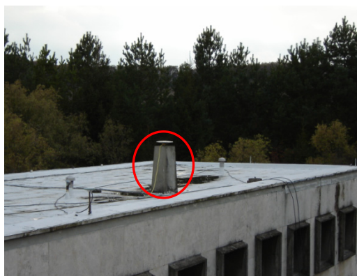
Figure 3. Penc, observatory building with reference station pillar in 2006