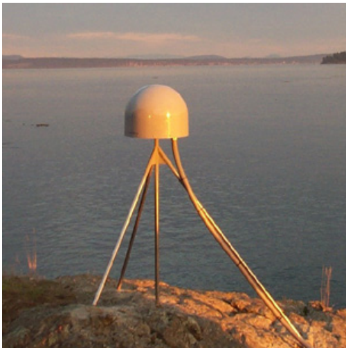
Figure 10. Short Drilled Braced Monument

Drilled braced steel monuments are the most stable antenna mounts. The vertical steel pole is placed in a hole drilled into bedrock, filed with grout.