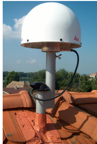
Figure 17. Antenna mounted on top of a pitched roof at station TATA Tata, Hungary