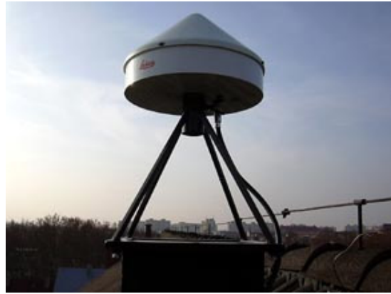
Figure 15. Antenna fixed to an unused chimney at station SZFV Székesfehérvár, Hungary

An antenna holding pole or pipe can also be built on top of a pitched roof. The lower part of the pipe must be rigidly fixed to a weight-carrying wall of the attic.